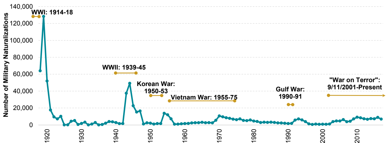
Figure 1. Annual Number of Military Naturalizations, Fiscal Years 1918–2017