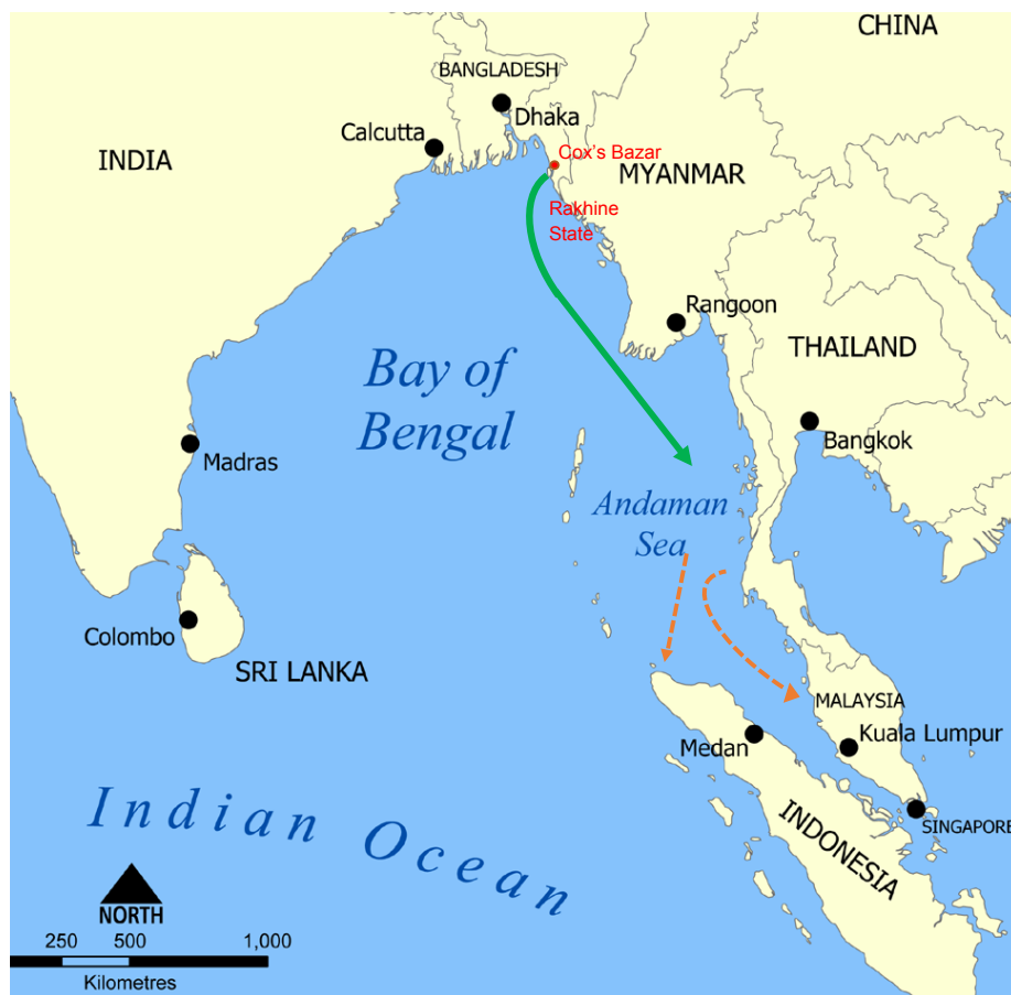
Figure 2. Migrants' Maritime Route to Thailand and Subsequent Movements, May 2015

Note: Most of the Rohingya and Bengalis who are smuggled or trafficked by sea depart from Cox's Bazar. It is unclear if any involved in the May 2015 incidents departed directly from Myanmar's Rakhine Province.